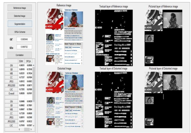
Fig. 4. Graphical User Interface for Objective tes.